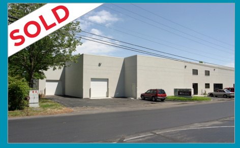
8035 Craig Street Indianapolis, IN 41,000 SF