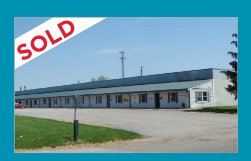
1727-55 N. Country Club Rd. Indianapolis, IN 31,000 SF