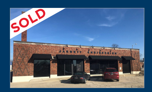
1011 N. Pennsylvania Indianapolis, IN 14,580 SF