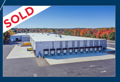
1 National Street Milford, MA 377.596 SF