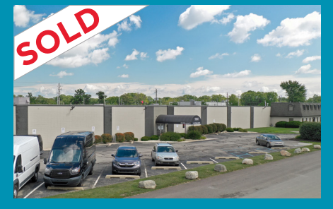
5282 E. 65th Street Indianapolis, IN 33,000 SF