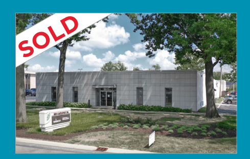
8025 Castleway Drive Indianapolis, IN 20,900 SF