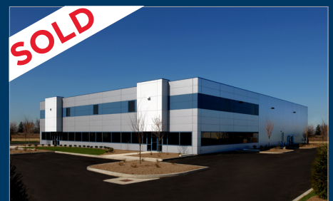
15255 Endeavor Drive Noblesville, IN 15,189 SF