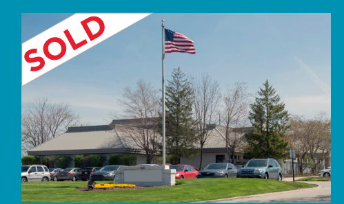
2265 Executive Drive Indianapolis, IN 38,210 SF