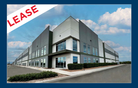
3610 E. Valencia Road Tucson, AZ 302,000 SF