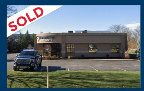
10078 Lantern Road Fishers, IN 5,022 SF