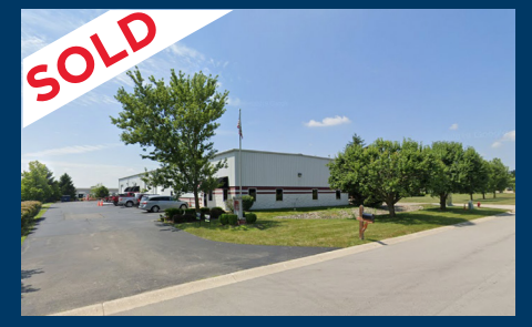
233 E. 175th Street Westfield, IN 12,600 SF