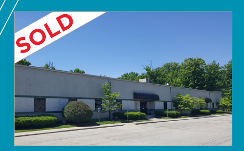
I-465 & Pendleton Pike Indianapolis, IN 41,250 SF