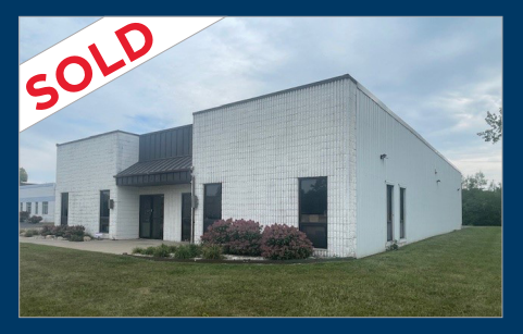
7857 E. 88th Street Indianapolis, IN 5,336 SF