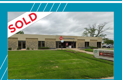
6330-40 Castleplace Drive Indianapolis, IN 68,000 SF