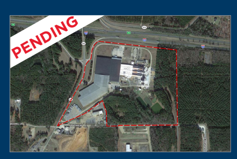
4241 Highway 563 Simsboro, LA 682,463 SF