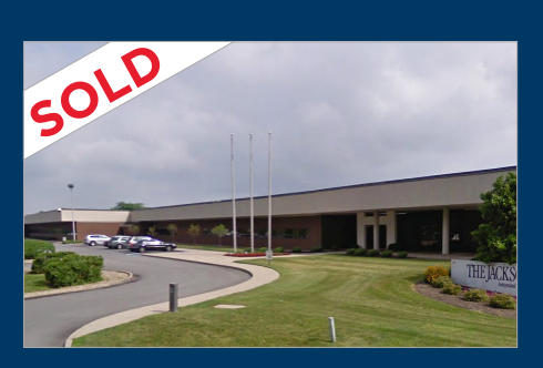
5808 Churchman Bypass Indianapolis, IN 206,000 SF