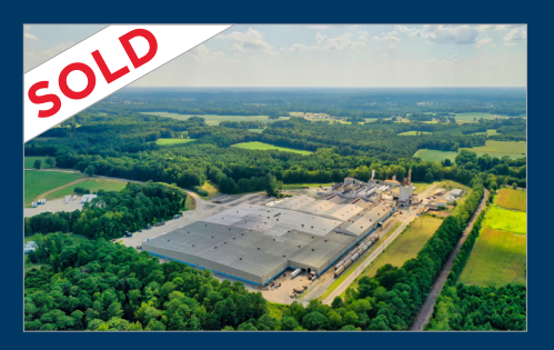
2201 Firestone Parkway Wilson, NC 550,000 SF