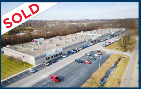
6438 Saguaro Court Indianapolis, IN 114.608 SF