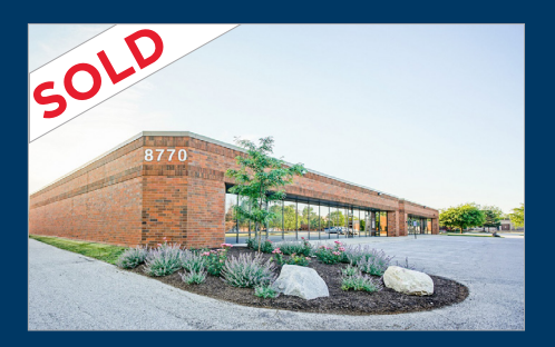
Commerce Park Indianapolis, IN 140.294 SF