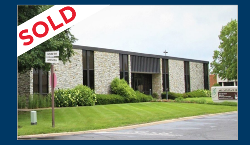
6405 Castleplace Drive Indianapolis, IN 12,020 SF