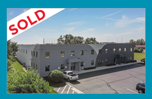
11793 Technology Lane Fishers, IN 31,377 SF