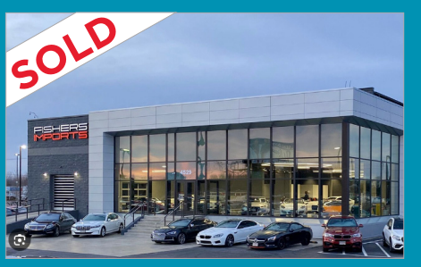
4529 W. 96th Street Indianapolis, IN 21,647 SF