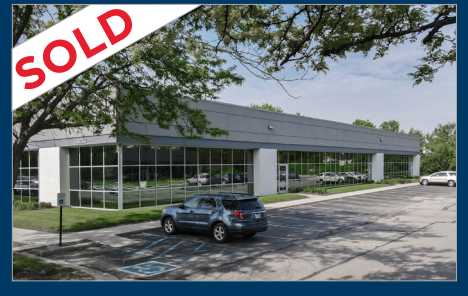
Carmel Tech Center Carmel, IN 209,064 SF