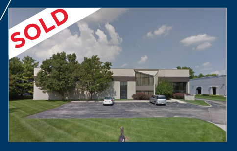
9114 Technology Way Fishers, IN 14,232 SF