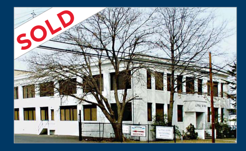
711 Lidgerwood Avenue Elizabeth, NJ 189,269 SF