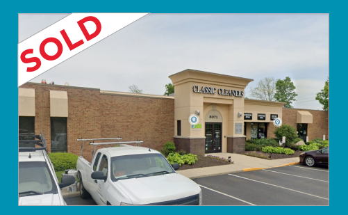
8071 Knue Road Indianapolis, IN 26,326 SF