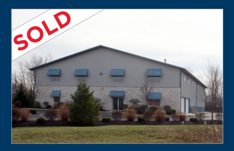
17455 Bataan Court Noblesville, IN 11,200 SF