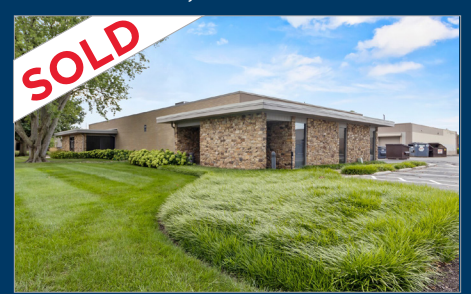
8004-08 Castleway Drive Indianapolis, IN 8,044 SF